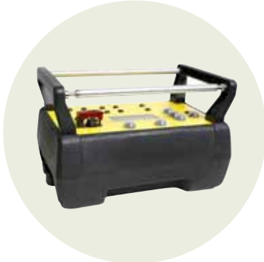
MC-3200 EX side view