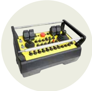
MC-3300 EX design according to customer requirements