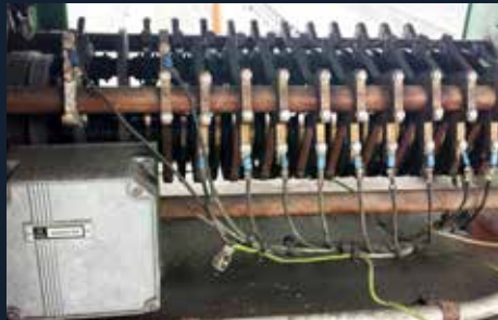
Obsolete LV Collector and Slipping Assembly

Our upgrade and replacement program ensures that existing cable reelers are equipped with the latest collector and slipping technologies.