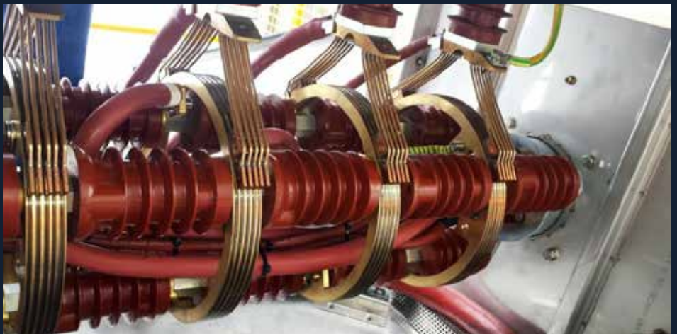
New Generation HV Collector and Slipping Assembly

Cavotec is a leading cleantech company that designs and delivers connection and electrification solutions to enable the decarbonization of ports and industrial applications.