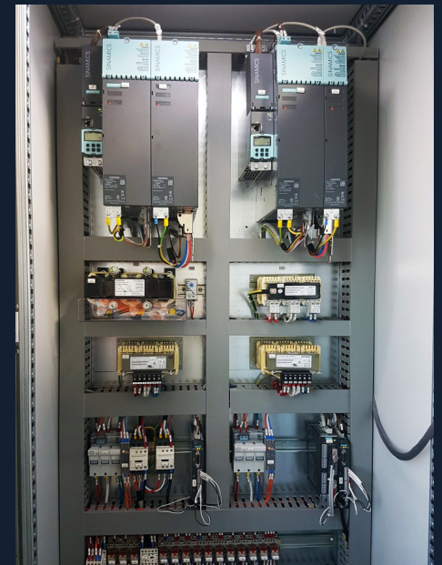
New Sinamics S120 Modular Drive

Cavotec is a leading cleantech company that designs and delivers connection and electrification solutions to enable the decarbonization of ports and industrial applications.