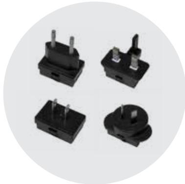
Adapter for power supply