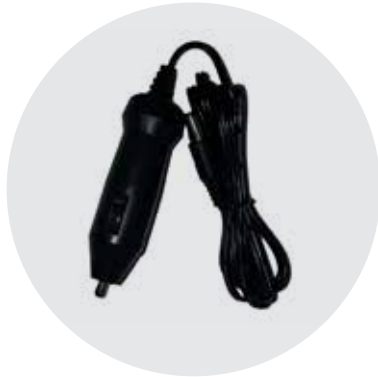
DC lighter plug

Cavotec is a leading cleantech company that designs and delivers connection and electrification solutions to enable the decarbonization of ports and industrial applications.