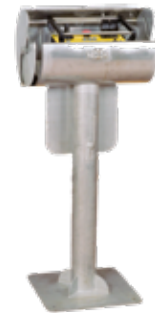
Pedestals for operating and storage for terminals