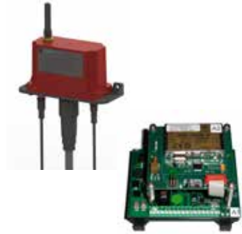
MC-MINI-Profibus or Din-Rail Receiver Unit

Cavotec radio remote control systems comply with a variety of international rules and regulations. All systems are CE marked and can be used with our FCC Part 90 approved radio. The systems are designed in accordance with the European Machinery Directive and comply with IEC 60204 and ISO 13849. In addition we have a wide range of compliant radios that can be used in type approvals of systems for specific countries worldwide.