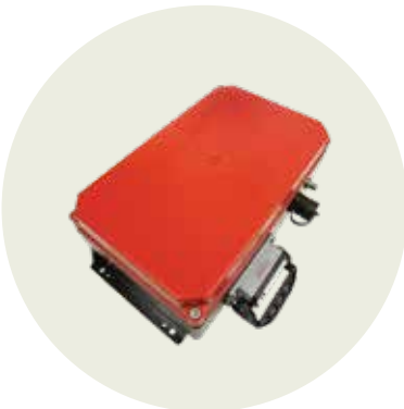
Standard MC- BUE1 Receiver Unit