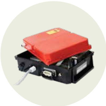
Opened MC-BUE2 Receiver Unit