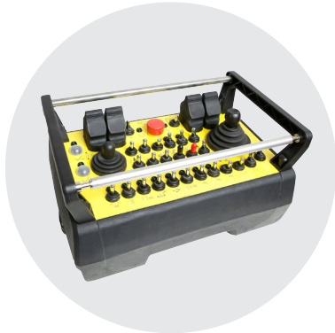
MC-3300 EX design according to customer requirements

Cavotec is a leading cleantech company that designs and delivers connection and electrification solutions to enable the decarbonization of ports and industrial applications.