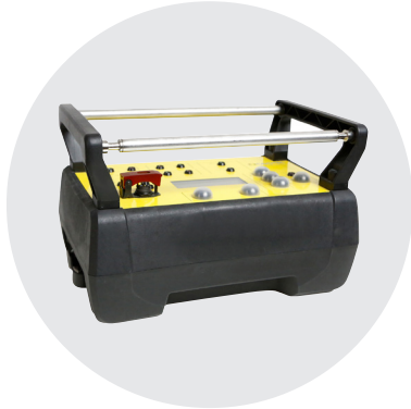
MC-3200 EX side view